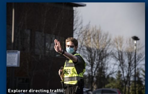
Explorer directing traffic