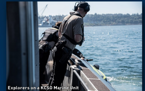
Explorers on a KCSO Marine Unit