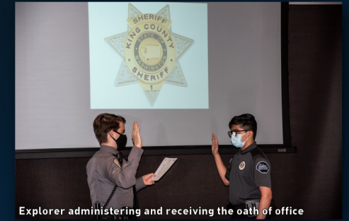
Explorer administering and receiving the oath of office