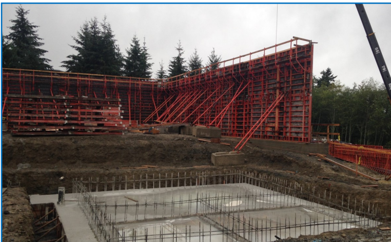
South-west wall of the Building