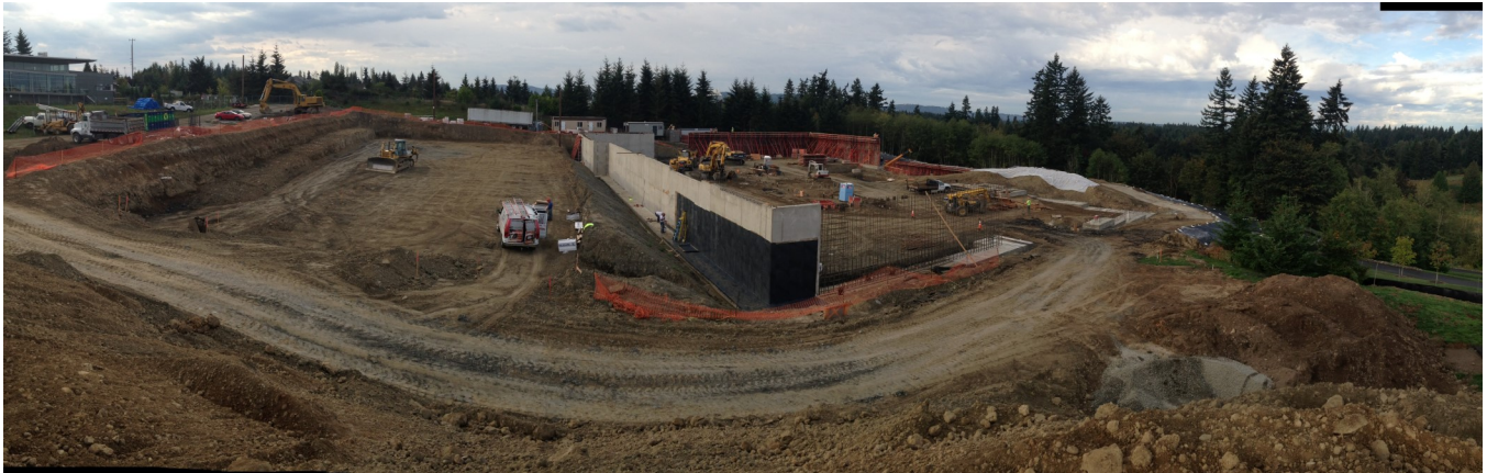
Below: Storm water Vault.